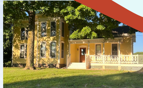
Sower House Shoppe and Tea Room- County Road 900 North, Rome City